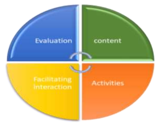
Fig (1): a pedagogical model for online teaching during covid-19 pandemic

Covid-19 forced schools and universities to transform from traditional learning to default one. At the same time, the Studyer used a pedagogical model (CAFE) to help teachers educate students with special needs during covid-19 pandemic online (Wang, 2020). The model consists of four stages: