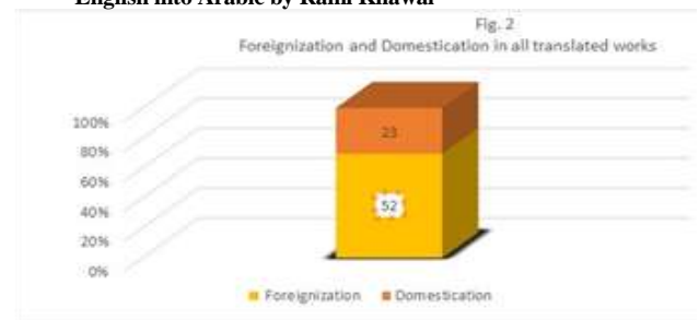
Fig (2) Foreignization and Domestication in all translated works